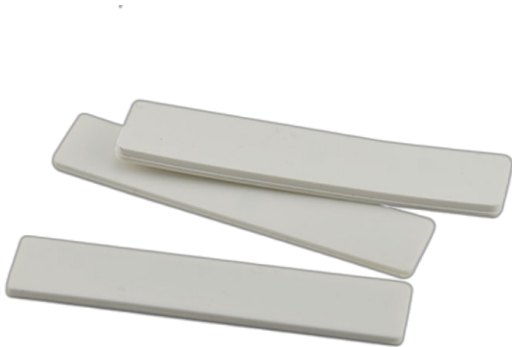
Silicone RAIN RFID laundry tag